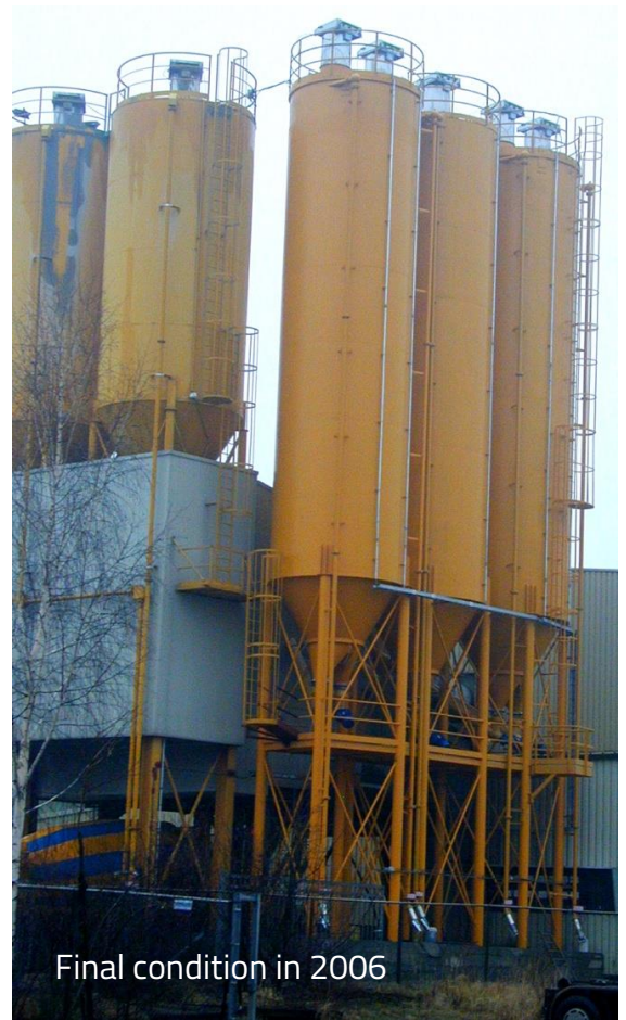
Final condition in 2006

17 years after the original application, i.e. on 11-09-2023, two representatives of ZINGAMETALL Belgium made an inspection on site. Their conclusion was that the 3 silos were still in perfect condition , but with some mechanical damages on the lower part of the silos.