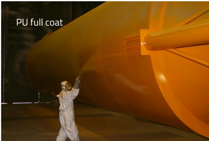
PU full coat