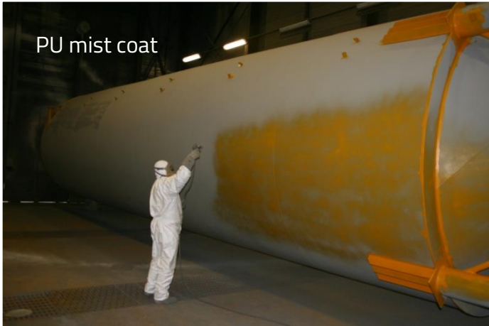
PU mist coat