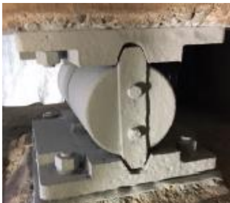
After application of ZINGA 180 µm DFT