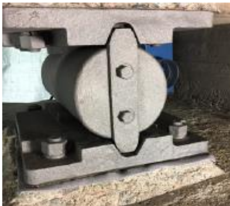
After cleaning and blasting