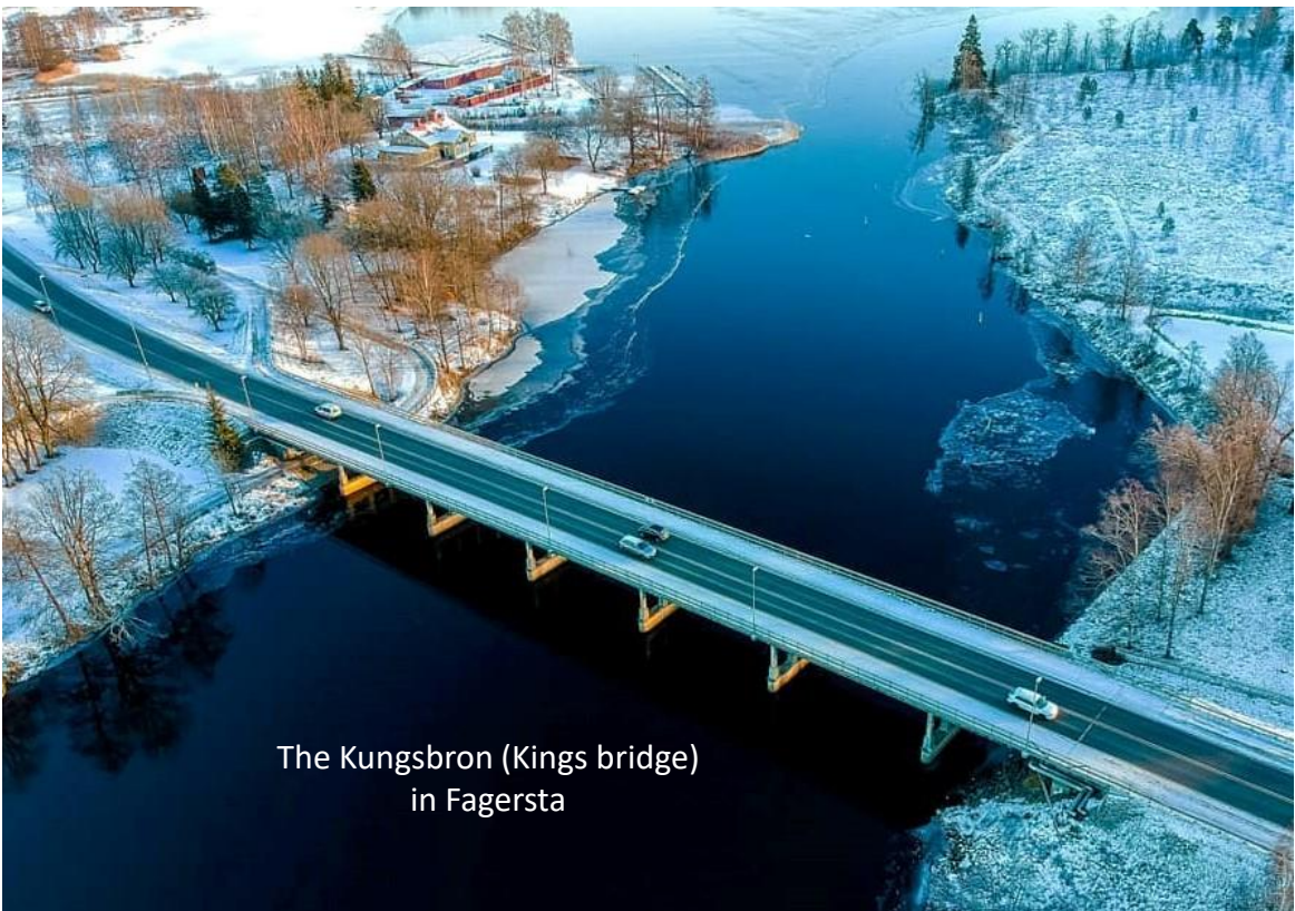
The Kungsbron (Kings bridge) in Fagersta

An inspection was carried out 2 years after the original application , in October 2018, showing the ZINGA in perfect condition !