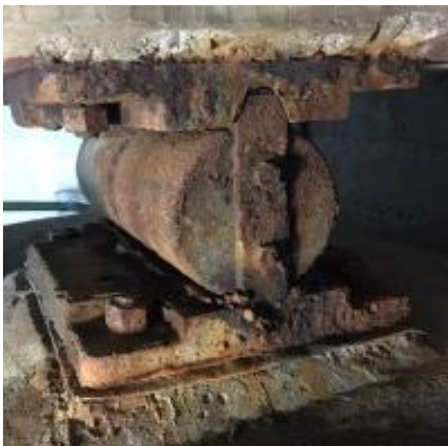
Before cleaning and blasting