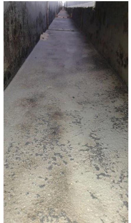
Condition before surface preparation

Some gutters were also replaced by new ones and protected with a ZINGA stand-alone system.